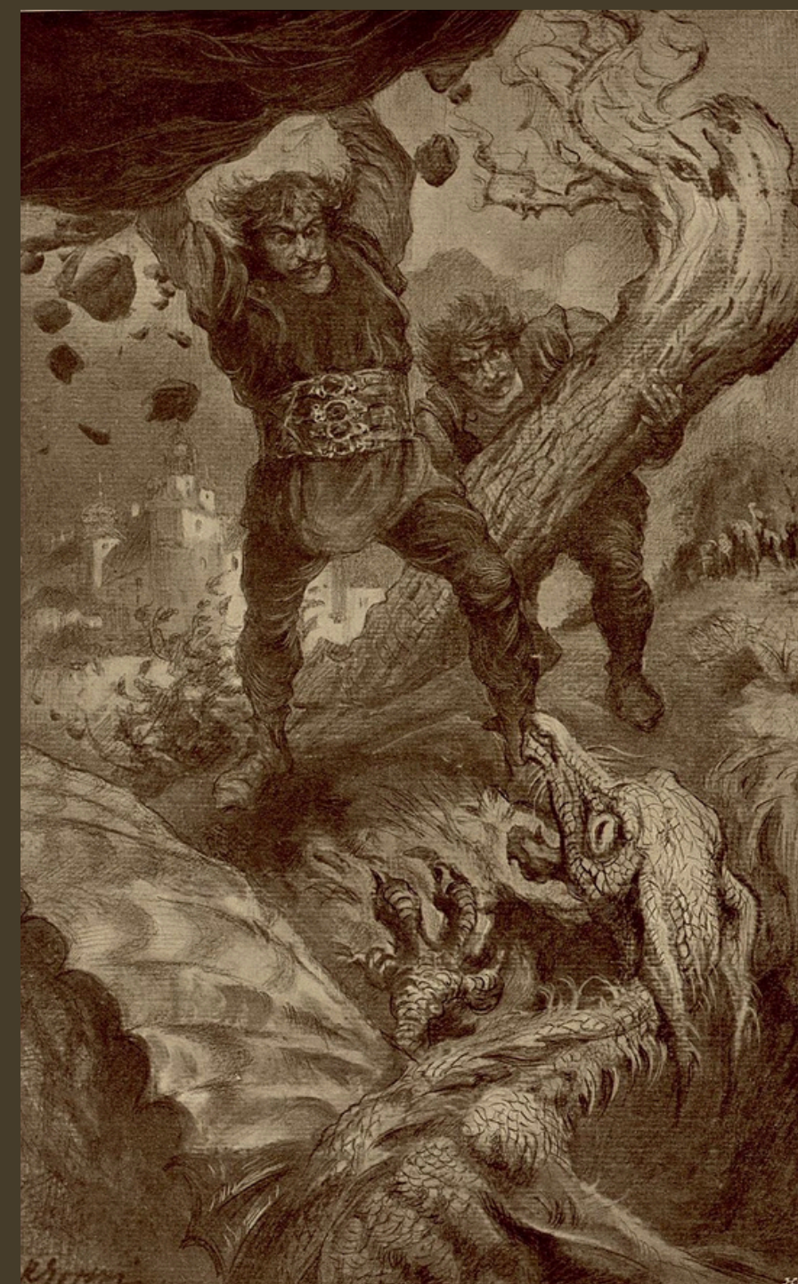
Gliński, Kazimierz "Bajki", 1912

The mother died after giving birth to the twins in the forest. One of the twins, Mountain Smasher, was taken care of by a wolf. He had such strength that he could knock down a mountain with his punch. The second, Oak Tearer, was fed by a bear. He had such strength that he could easily uproot oak trees.